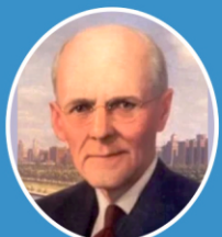
Rtn. Paul Harris Founder